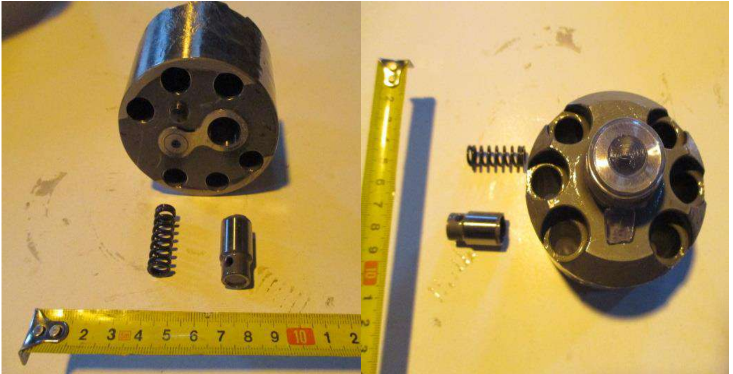
Valve support complete