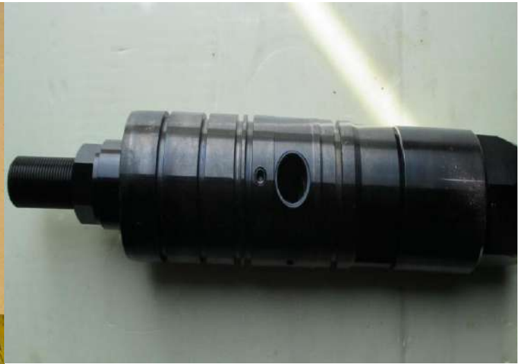
Fuel injection valve without nozzle