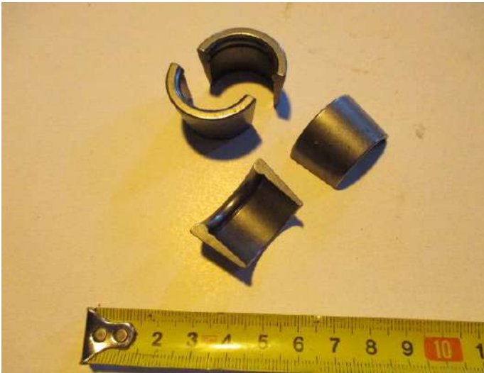
Valve cone in two piece