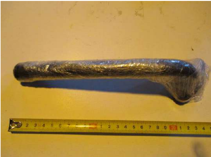
Oil drain pipe