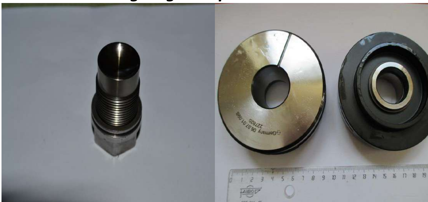
Baffle screw flat type