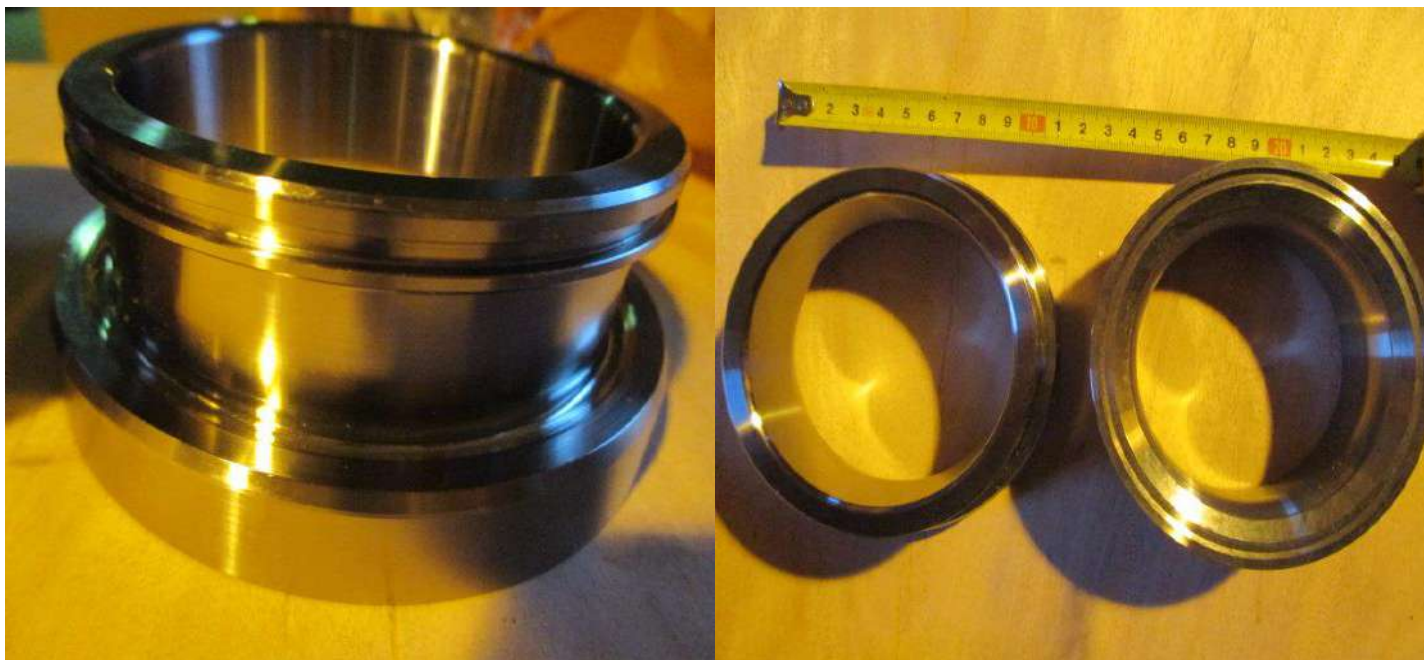
Valve seat (standard size) Maximum diameter - 121 mm Sealing ring seat place - 109 mm